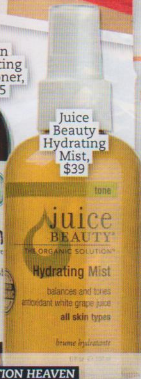
Juice Beauty Hydrating Mist, $39