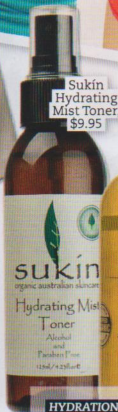
Sukin Hydrating Mist Toner, $9.95