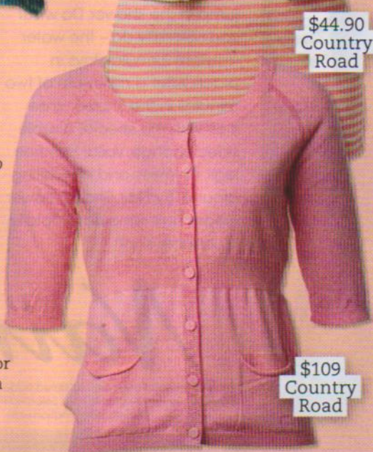
$44.90 Country Road

Grab a little cropped cutie to cover up without killing your summer outfit. Summer means it's time to lighten up, so ditch bulky fabrics and give dark colours a break. These three jackets are easy care because when it's hot, they will probably spend most of their time tossed on a sofa or thrown into a bag, but when needed will be crease-free and won't let you down when the sun disappears over the horizon.