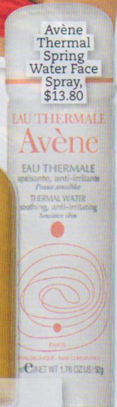
Avène Thermal Spring Water Face Spray, $13.80